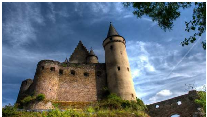
Finance stronghold: Luxembourg receives more than a 10th of the world's foreign direct investmen

The low-tax system that has brought great prosperity to the Grand Duchy now threatens to become a liability